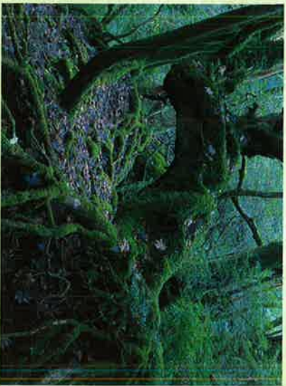
Genseirin (Primeval Forest)