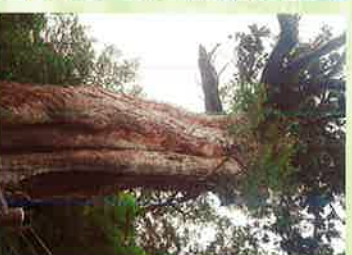
Yayoi Hiking Trail Top 100 Megarivers of Japan